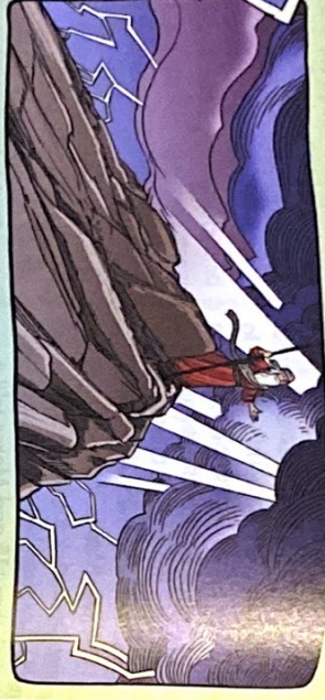
Exodus 20:2-3, 6-8, 12-17 (For the full story, read Exodus 19:16-20:17.)

2 "I am the LORD your God who brought you out of Egypt, where you were slaves. 3 Worship no god but me. 6 I show my love to thousands of generations of those who love me and obey my laws. 7 Do not use my name for evil purposes. . . . 8 Observe the Sabbath and keep it holy. 12 Respect your father and your mother. . . . 13 Do not commit murder. 14 Do not commit adultery. 15 Do not steal. 16 Do not accuse anyone falsely. 17 Do not desire another man's house; . . . his wife, his slaves, his cattle, his donkeys, or anything else that he owns."